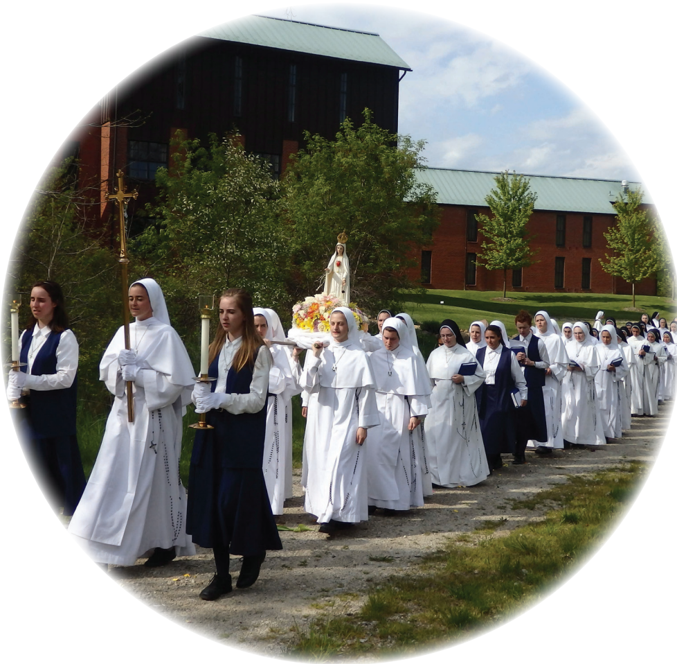
Dominican Sisters of Mary, Mother of the Eucharist