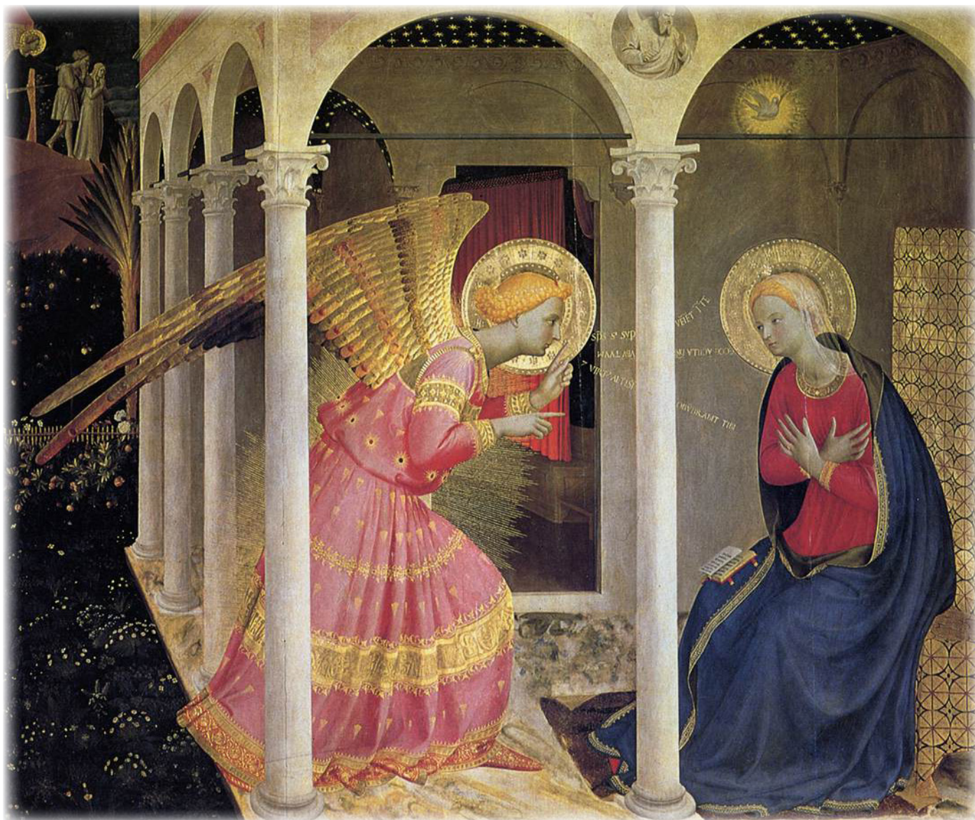
The Annunciation , Fra Angelico - Public Domain