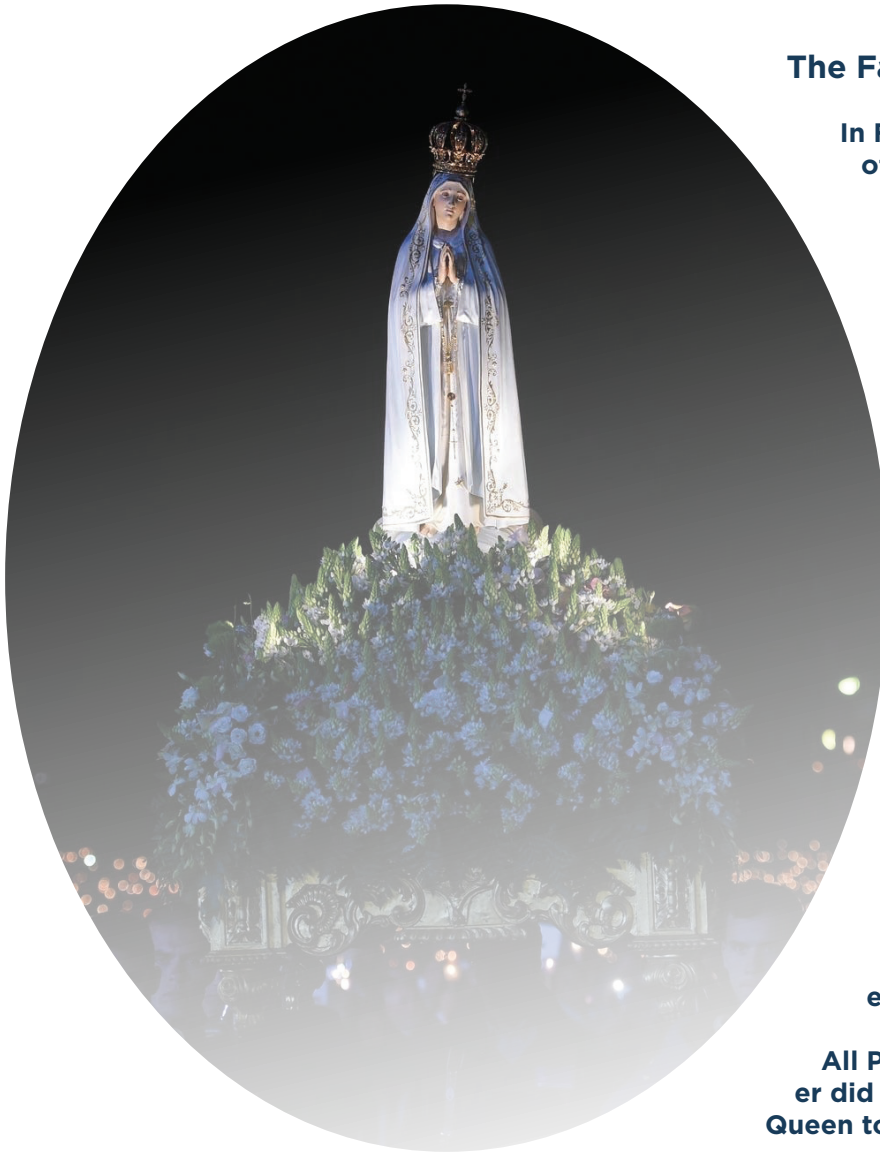
Our Lady of Fatima Procession – Public Domain