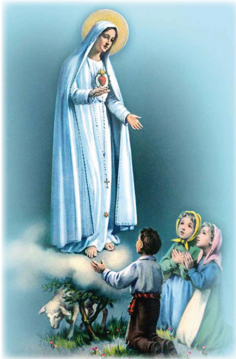
Our Lady of Fatima

WE SAW...A LADY DRESSED IN WHITE... MORE BRILLIANT THAN THE SUN... HER FACE INDESCRIBABLY BEAUTIFUL.